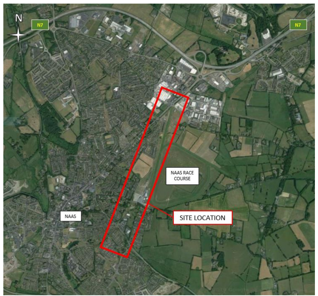
Figure 1 Site Location Map

The location of the site is shown in Figure 1 below.